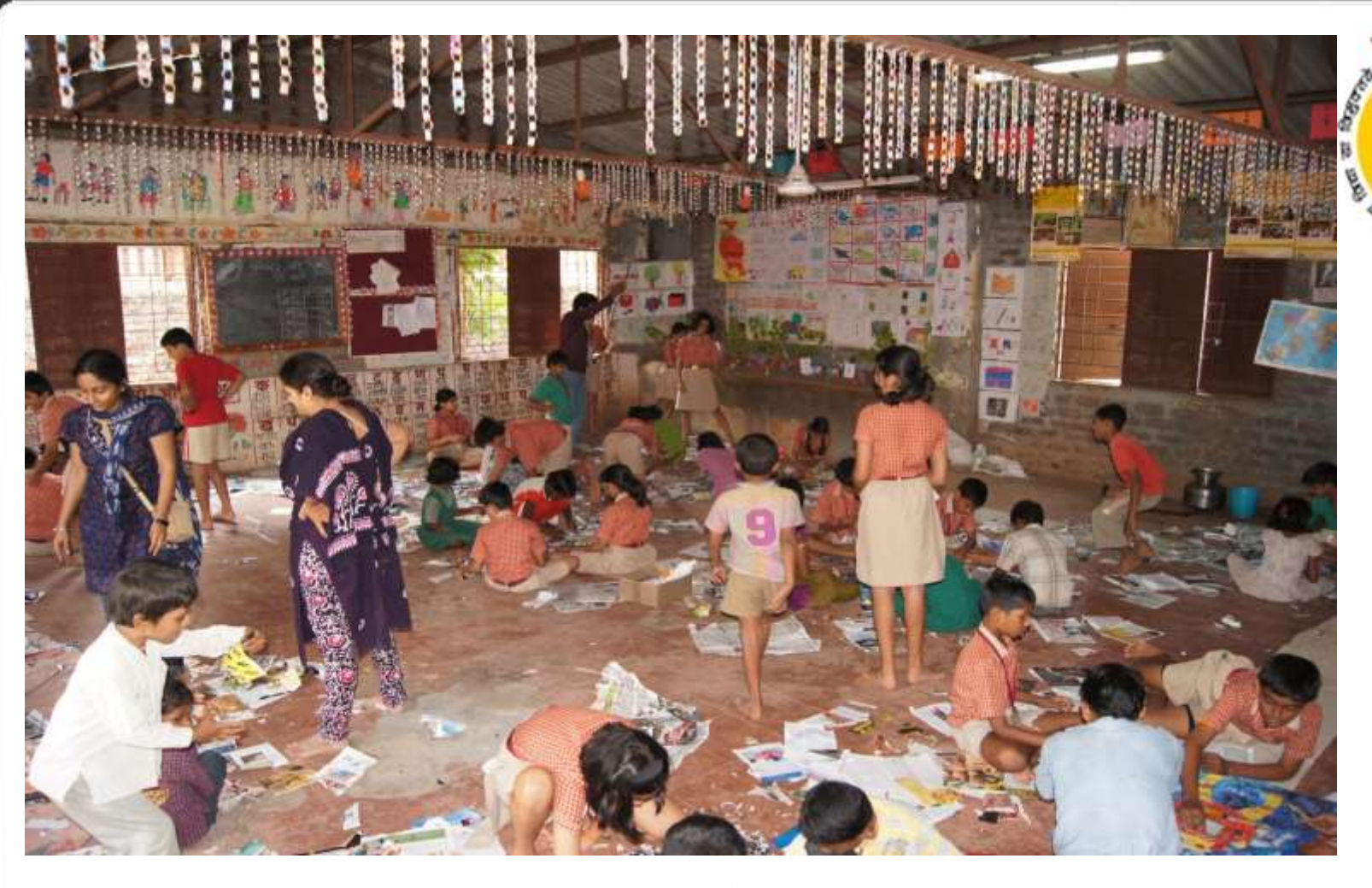
Day 1 – Ideating and preparing material for the collage work in groups